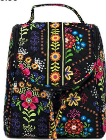
bon appétit #10029 7"X8.5"X4.5" strap drop 2" suggested retail $28