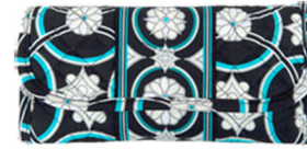
convertible wallet #10017 8.5"x4" removable 48" shoulder strap removable 7" wrist strap suggested retail $33