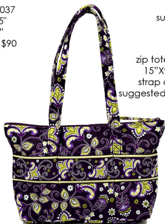
zip tote #10016 15"X9.5"X4" strap drop 11" suggested retail $66.50