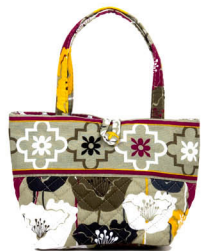
pippa#10043 8.5"X5.5"X3.5" strap drop 4.25" suggested retail $17