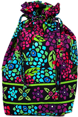
jitney #10045 6"X14.5"X7.5" suggested retail $24.50