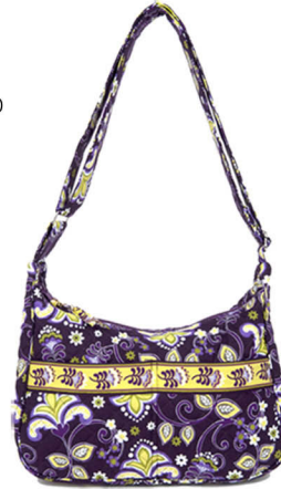
shoulder bag #10003 11.25"X8"X3.75" 48" adjustable strap suggested retail $53