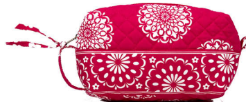
NEW medium cosmetic #10051 7.75"X4.5"X3" suggested retail $23.50