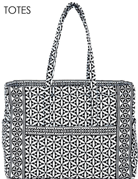
x-large tote #10037 20" x 14.5" x 8.5" strap drop 12" suggested retail $90