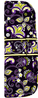
flat iron/curling iron cover #10033 13.75"X4.5" closed/13.75"X9" open suggested retail $17