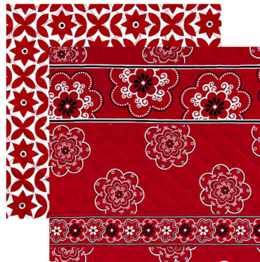
America Red #021