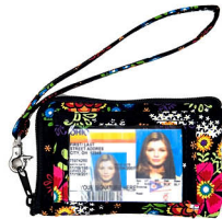
ID wristlet #10024 5.5"x3.5" removable 7" wrist strap suggested retail $20.50