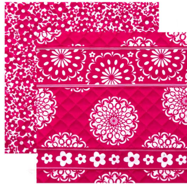
NEW Pink and Proper #027 (2/15/13)*