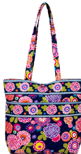
tote #10011 15.25"X13"X4" strap drop 12.75" suggested retail $40