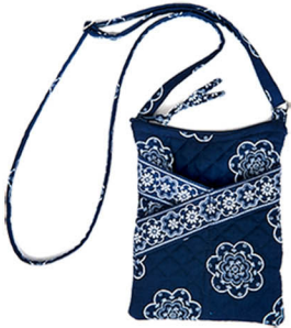
mini sling #10048 6"X8"X0.5" 48" adjustable strap suggested retail $41.50