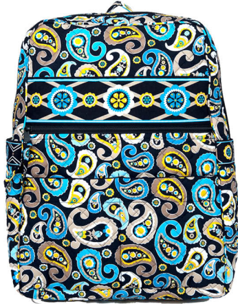
large backpack #10038 11.5"X15.25"X5.75" 38" adjustable straps suggested retail $95