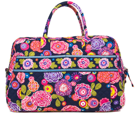
carry on #10002 18"X11.5"X8" 48" adjustable/removable strap suggested retail $79.50