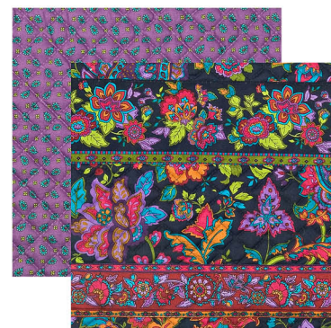
French Quarter #002