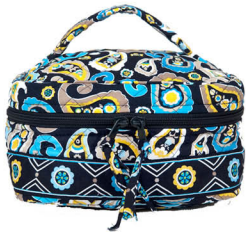
cosmetic case #10019 8"X5"X6.25" suggested retail $35.50