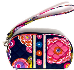
gadget wristlet #10030 6"x3.5"x1" removable 7" wrist strap suggested retail $22.50