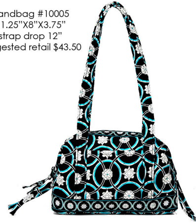
handbag #10005 11.25"X8"X3.75" strap drop 12" suggested retail $43.50