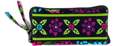
zip around wallet #10049 8"x4"x1" suggested retail $49