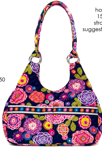
hobo #10034 15" x 10" x 6" strap drop 13" suggested retail $68.50