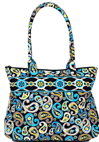
uptown tote #10046 15"X12"X4" strap drop 10" suggested retail $68.50