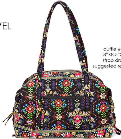
duffle #10008 18"X8.5"X10.75" strap drop 15" suggested retail $68.50