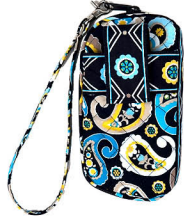
everything wristlet #10044 6"x3.5"x2" removable 7" wrist strap suggested retail $28