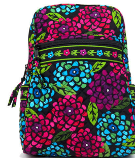
backpack #10009 9.5"X13.25"X4" 34" adjustable straps suggested retail $70.50