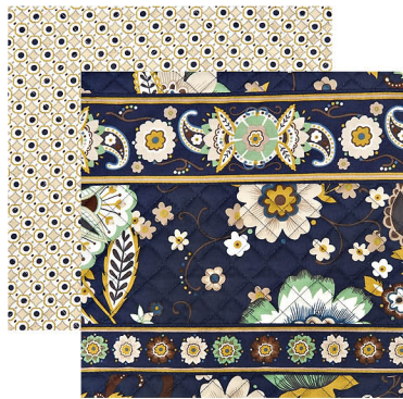
Indigo Garden #018