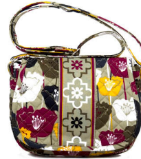
tag-a-long #10035 9" x 7.5" x 3" 48" adjustable strap suggested retail $39.50