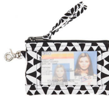
zip id and key #10036 5" x 3" suggested retail $12