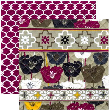
NEW Perfectly Poppy #028 (2/15/13)*