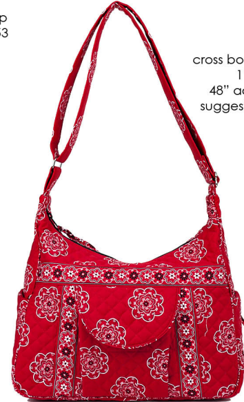
cross body cargo #10042 11"X13"X5" 48" adjustable strap suggested retail $79.50