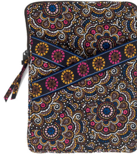
e-tablet cover #10040 7.5"x10.5" suggested retail $27