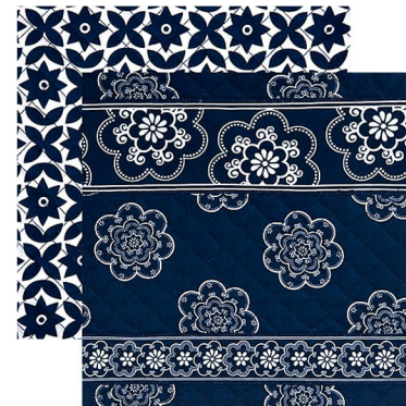
America Blue #023