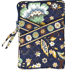
e-reader cover #10039 6"x8.75" suggested retail $24.50