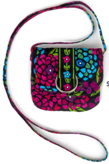
minnie #10041 6" x 5" strap drop 29" suggested retail $25.50