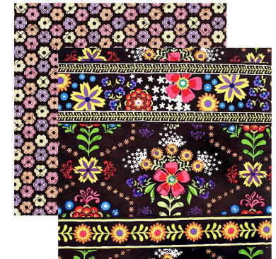
Bloom Dance #012