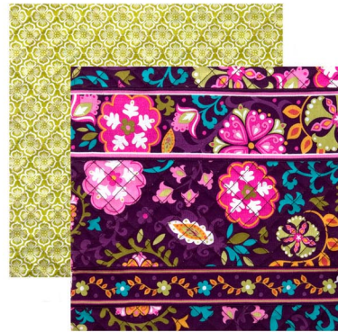
NEW Genevieve #029 (Mid-Spring)*