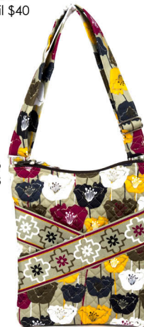
NEW sling #10052 10"X12"X0.5" 48" adjustable strap suggested retail $58 (2/15/13)*