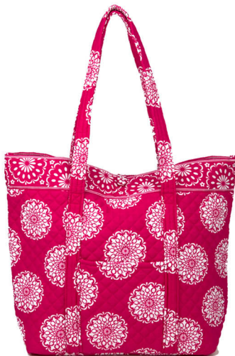
large square bottom tote #10001 19.5"X15"X6.25" strap drop 10.5" suggested retail $66.50