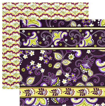
Purply Pear #017