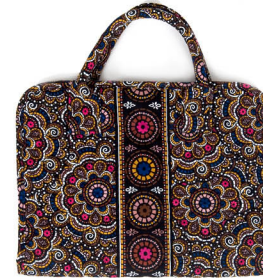
hanging cosmetic #10020 12.5"X9.75" closed/12.5"X19.5" open suggested retail $42.50